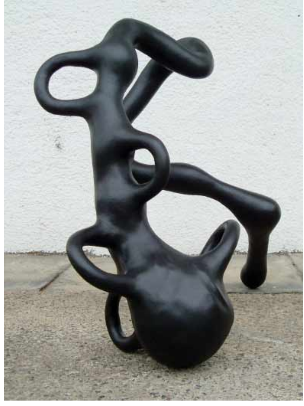
Rümperien # 100.555, object (Plastiform ^{\textcircled{R}} ), 55 x 70 x 50 cm