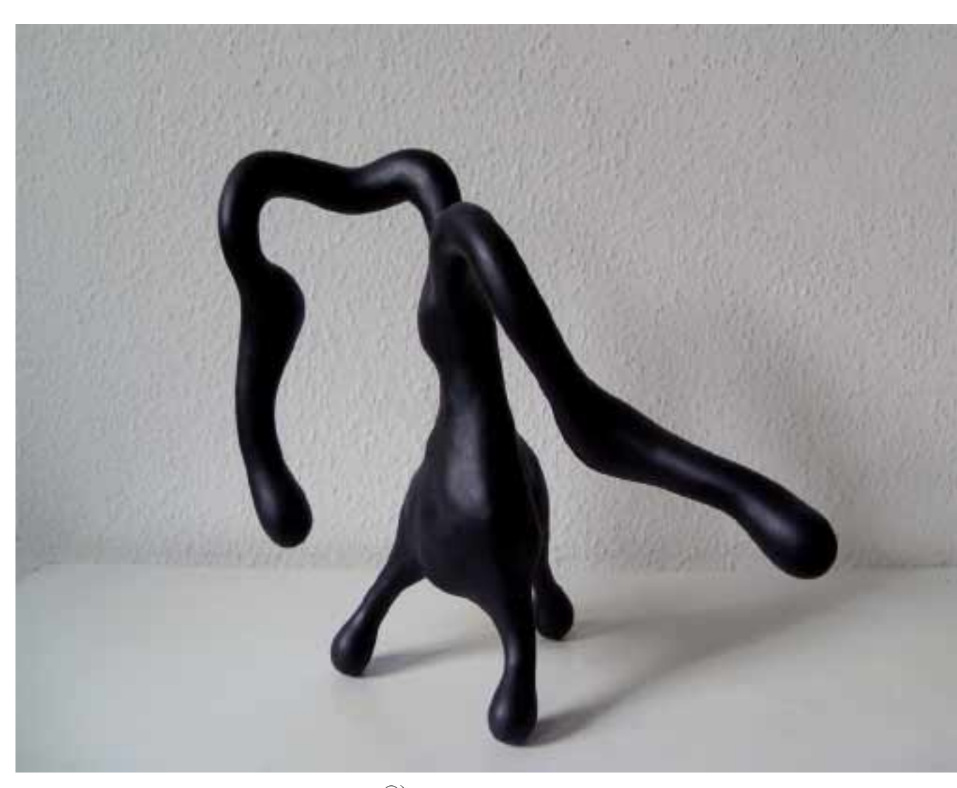
Rümperien # 100.556, object (Plastiform®), 50 x 50 x 40 cm

They are very shy and show themselves to humans only rarely. But their natural curiosity let them penetrate into human homebound units again and again.