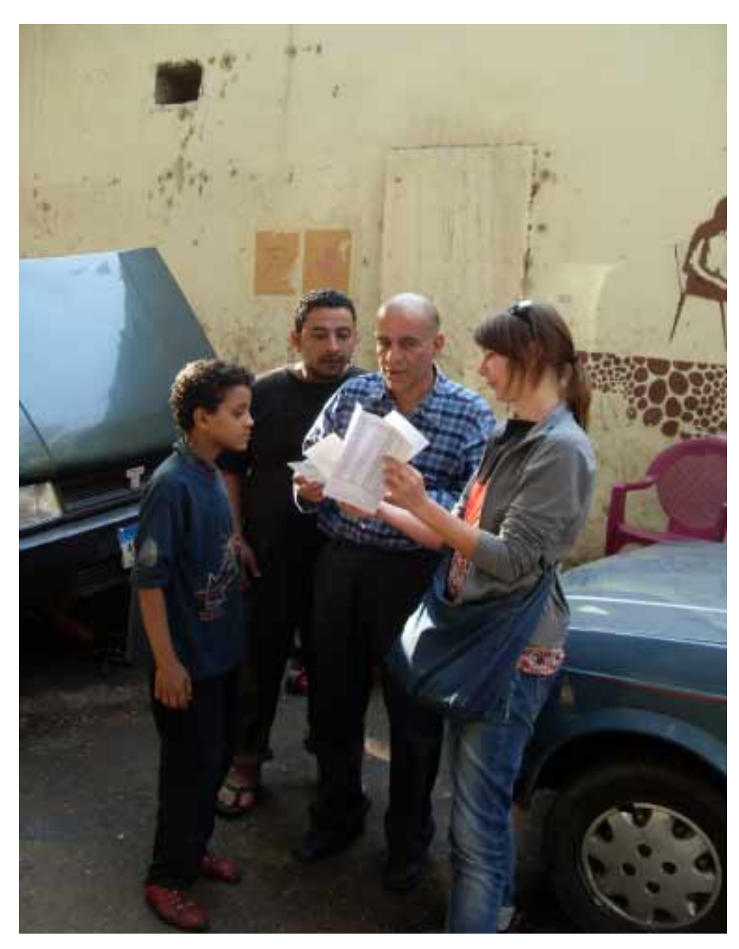
The Artist in talk with some people